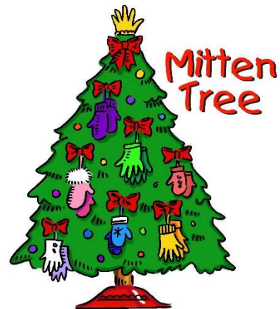
WILL BE READY FOR KIDS MITTENS ON DEC 8th DONATIONS GO TO WIC