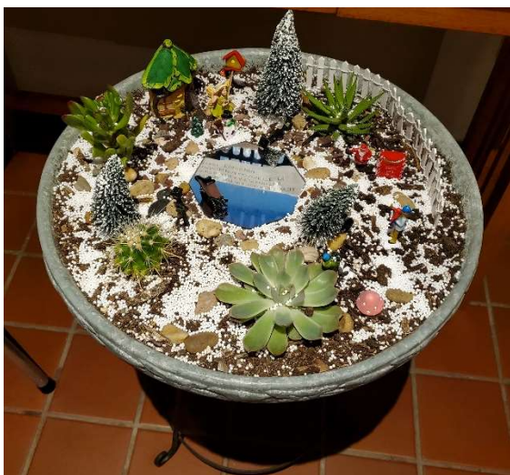
WINTER and SNOW HAS ARRIVED AT OUR FAIRY GARDEN