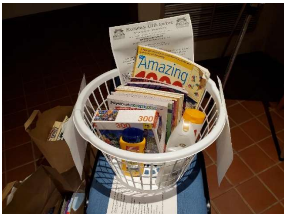
DONATIONS FOR MEALS ON WHEELS, ORGANIZED BY FAYE JONES