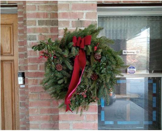
OUTSIDE WREATH DECORATIONS BY DICK REHM