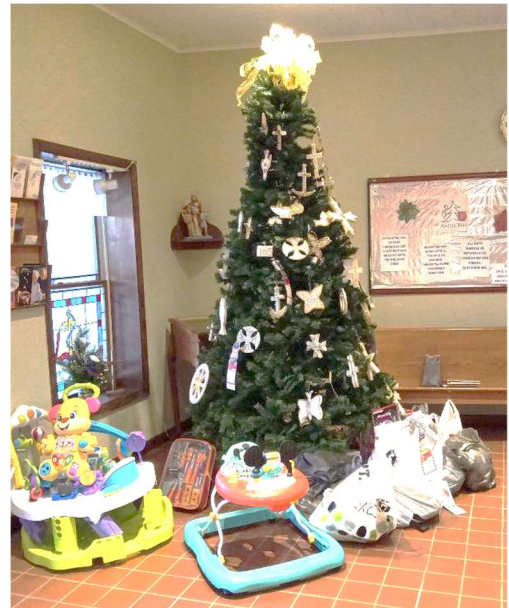
SALVATION ARMY ANGEL TREE