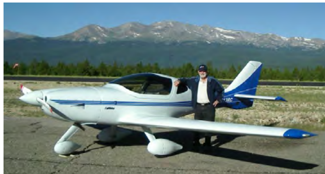
Dick's jet with the Colorado Rocky mountains in the background.