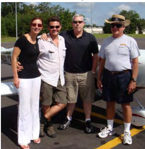
More Florida fun.