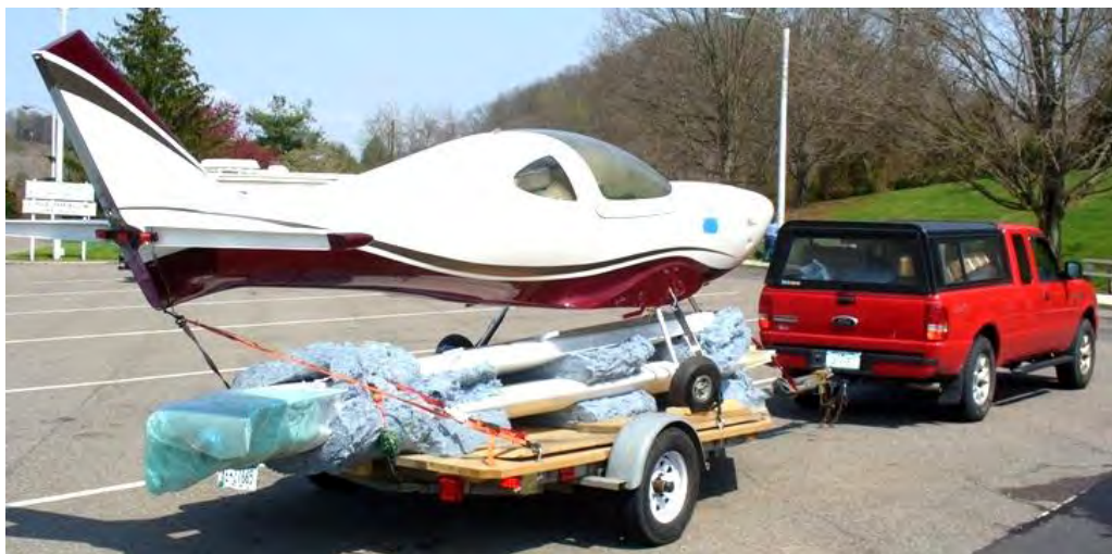
The blue fluffy stuff is cotton insulation made from recycled blue jeans... great padding!