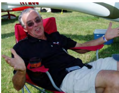
More Light Sport Mall photos.