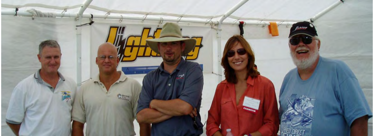
The Lightning Choir performing at the booth during the builder's get together on Friday. The song they were singing was "Pants on the ground". That's why the bottom of this photo was cut off.