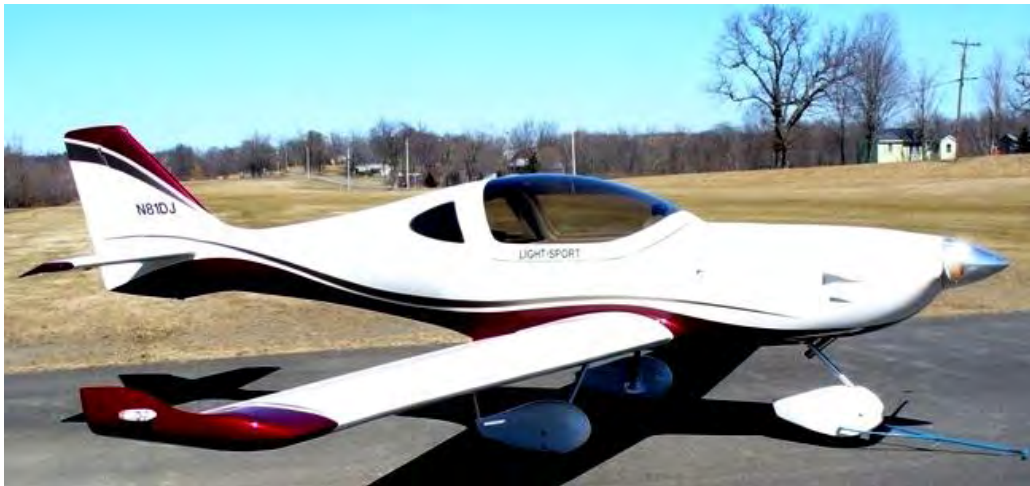
N81DJ, First Lightning ELSA, Ready for Airworthiness Inspection