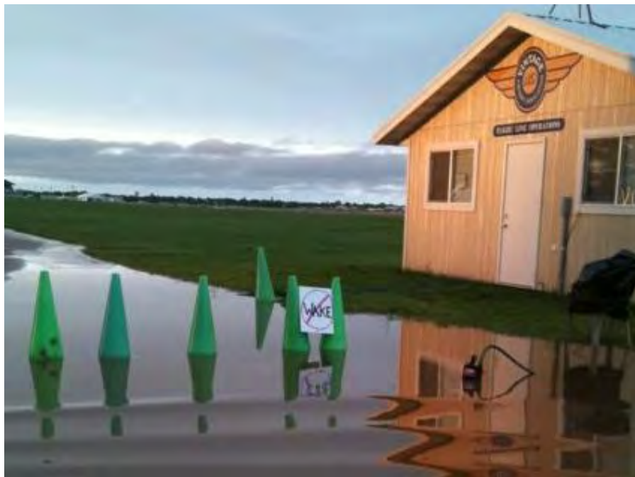
NO WAKE Zone in Vintage Area at SPLOSHKOSH 2010.

Oshkosh - July 2010 turned out to be the wettest month in Wisconsin history, but that didn't quell the spirit and enthusiasm of the AquaVenture attendees (see photo below). Actually, once the show started, the weather was pretty nice for the week of AirVenture. But the rain totals leading up to the show start caused major problems for those flying in or driving in to Oshkosh for opening day. The grass parking areas on the airport were unusable for the first days of the show and that caused the airport to be closed to inbound aircraft once the paved parking areas were full. Surrounding airports were full as well so many aircraft inbound to OSH had to divert for a place to park. Campers with motor homes or large trailers had similar problems, with many of them getting stuck up to their axles as they tried to park in the normal camping areas. EAA rented many off-site areas for the heavier campers to use, but overall, the total numbers of campers attending seemed to be almost as many as in past years. As things dried out on the field, show planes (experimentals, vintage, and warbirds) were allowed to come in, but the general aviation aircraft that park in the north 40 were held out a little longer. By day three of the show, things had dried out enough for things to get back to normal, and the field was finally opened to all aircraft.