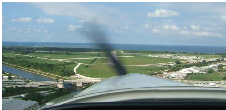
On final for runway 22.