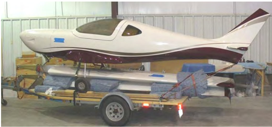
N81DJ loaded and ready for the journey to Kline Kill, NY (NY1)