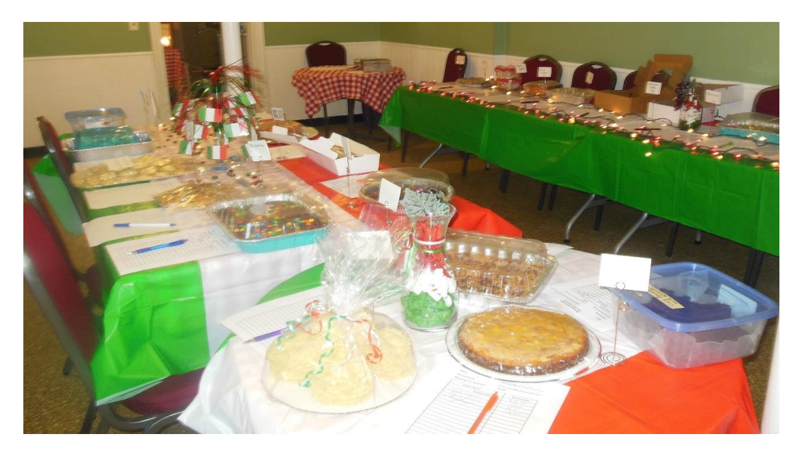
Goodies for our charity Bake Sale