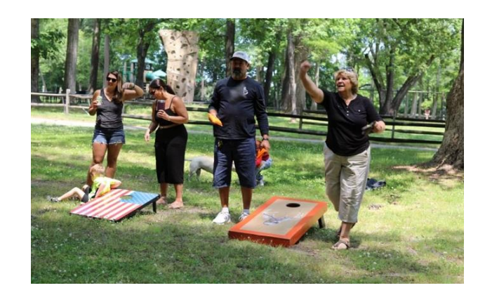
As is our tradition, we held our annual picnic in May. It was a great success and we even had members from the Italo American Citizens Lodge join us. We had enough people to have a mini-Corn Hole tournament!

In October we held our annual Columbus Day celebration. It was held at Immaculate Conception Church in Hampton instead of our usual meeting place at the Knight's of Columbus. Because of the change in venue, we were able to have one of our two fundraising events, a lucky ticket drawing. The money from this raffle helps the lodge defray the cost of our Christmas Charity. Members are asked to donate items and, of course, purchase tickets to participate in the raffle!