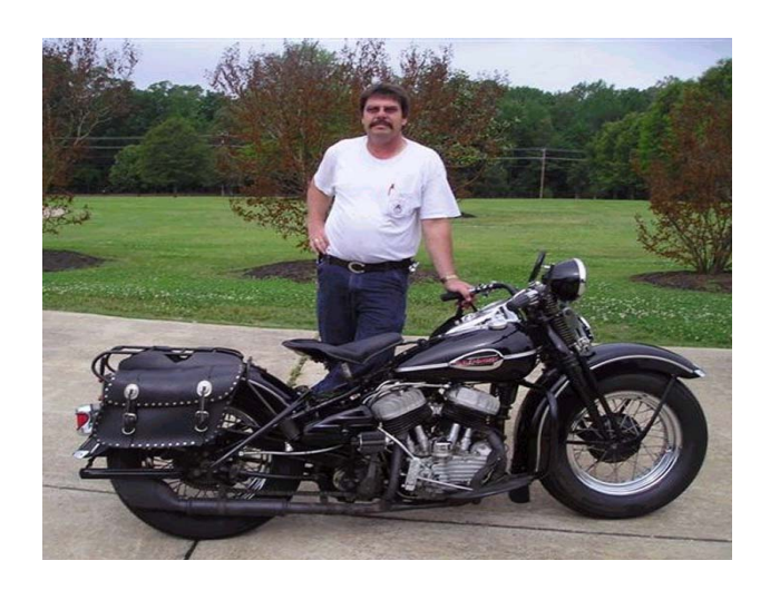
Written by Cooper

The evening turned out to be the highlight of the day. Better than 18 people all sitting around having a blast. Telling stories (some true of course) and enjoying life to the fullest!!!!!!!!! The only thing I can think of that is to look forward to next year to see if we can top this year.