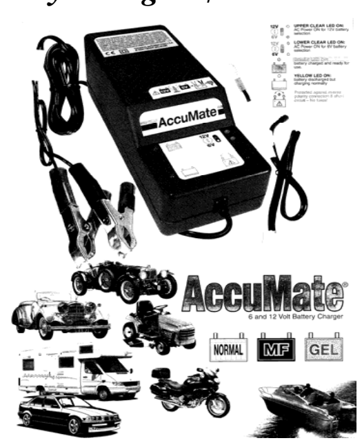
Available at Super Cycle. Don't forget to ask for your AMCA Confederate Chapter discount!