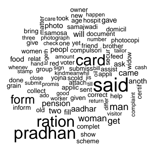
Figure 1 - "Rations" topic #17

Figure 1 displays the word cloud for the "Rations" topic. The most prominent substantive words displyed here are pradhan, ration, card, and form, with a wide range of other associated words, including photograph, food, aadhar, <sup>16</sup> man, woman, and submit. The majority of the words shown here seem to reference requests to the pradhan for assistance in acquiring a ration card or other government document, or accessing the benefits associated with these documents.