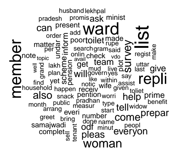
Figure 3 - "Beneficiary Lists" topic #19

Each topic appears with differing prevalence in the corpus of text. To summarize the relative importance of each topic in the overall set of observations, Figure 4 graphs the proportion of the corpus that can be accounted for with each topic, as well as its three most common words. This depiction suggests that a substantial portion of the text is made up of observations of and with the Pradhan: topics 4, 3, and 7 all concern the shadowers' observations of the presidents and questions posed to the presidents about their work. Beyond these observations, the next set of common topics, 12, 11, 16, 18, and 17 all concern the presidents' work, whether this is participating in public meetings, responding to requests about government programs, meeting with bureaucrats, or traveling between these various activities. Somewhat less common topics concern a variety of activities including discussions of construction projects (14), visits to schools (6), the making of beneficiary lists (19), and taking breaks for tea (15).