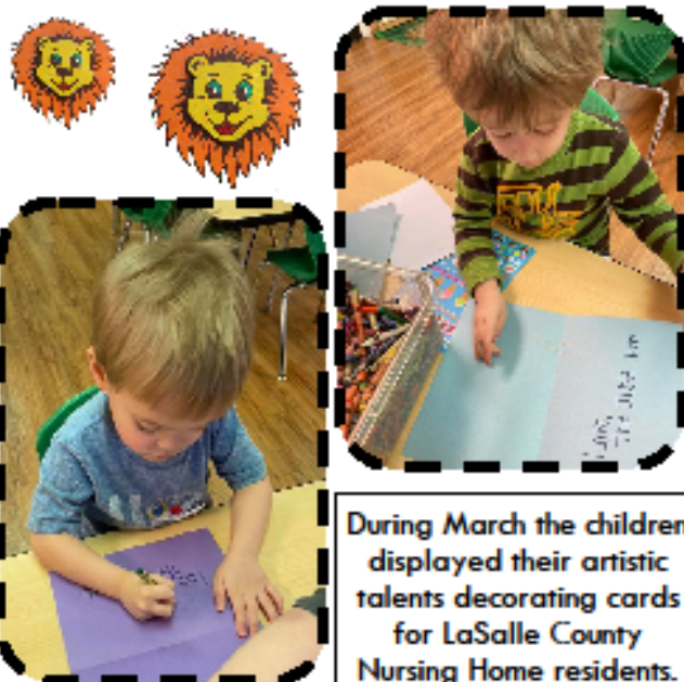
During March the children displayed their artistic talents decorating cards for LaSalle County Nursing Home residents.