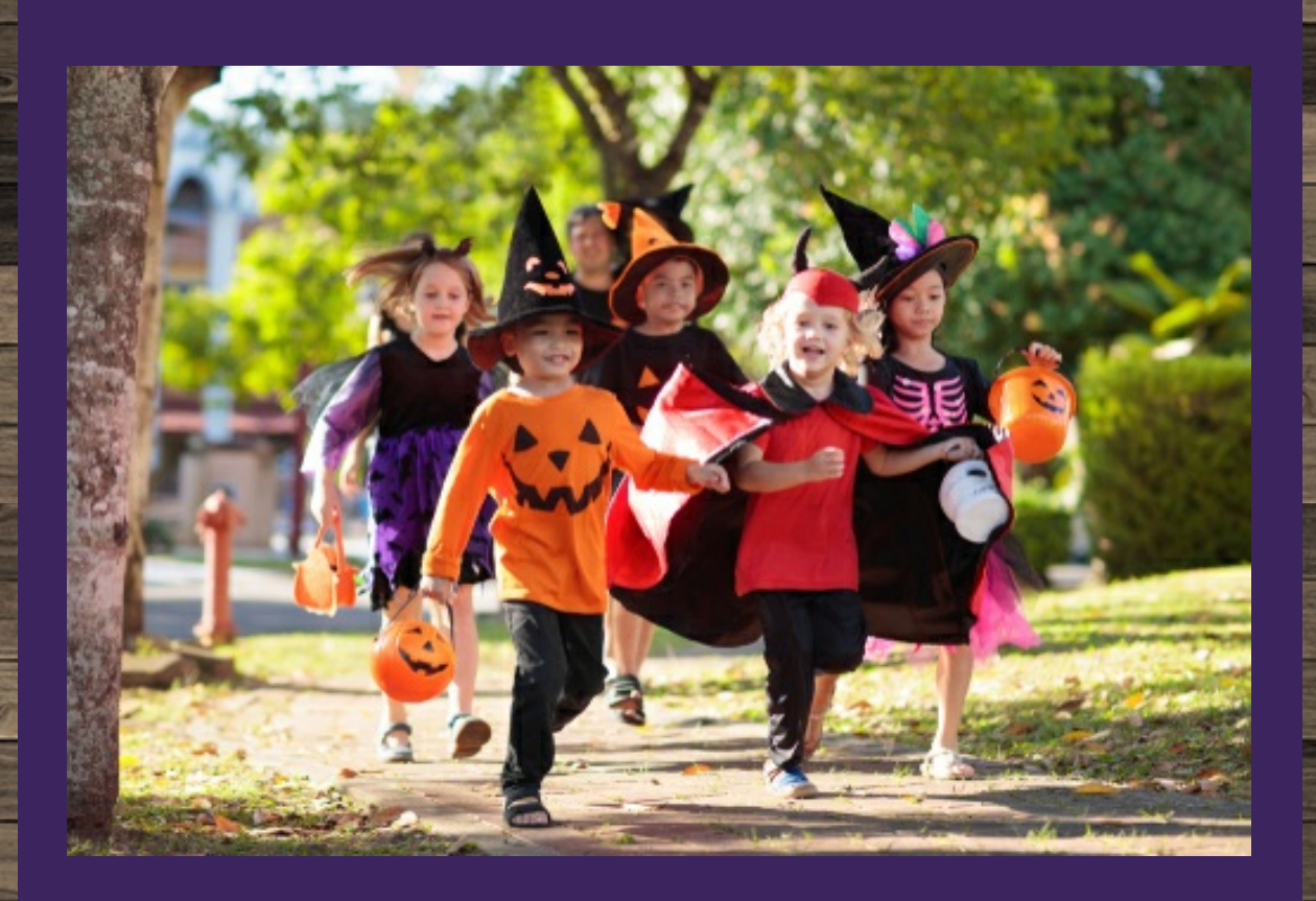
Wishing you a spook-tacular Halloween!