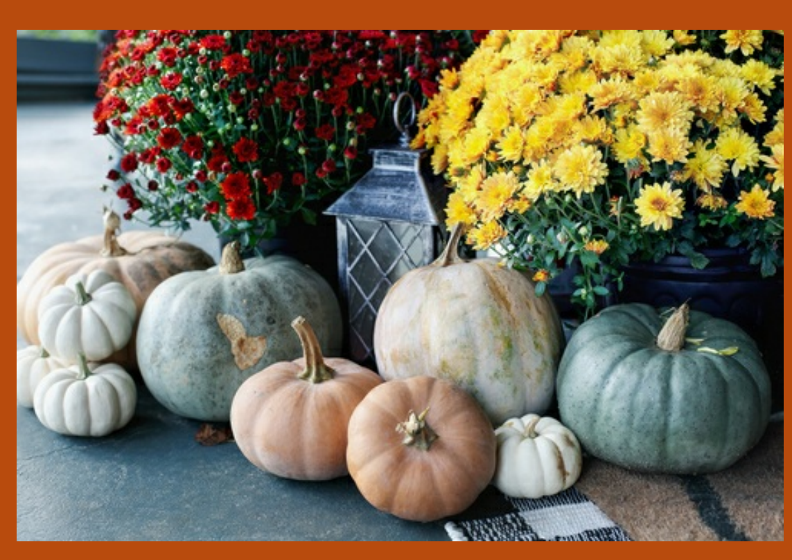
e-NEWS October 2021

Serving the Residents of Lakewood Forest