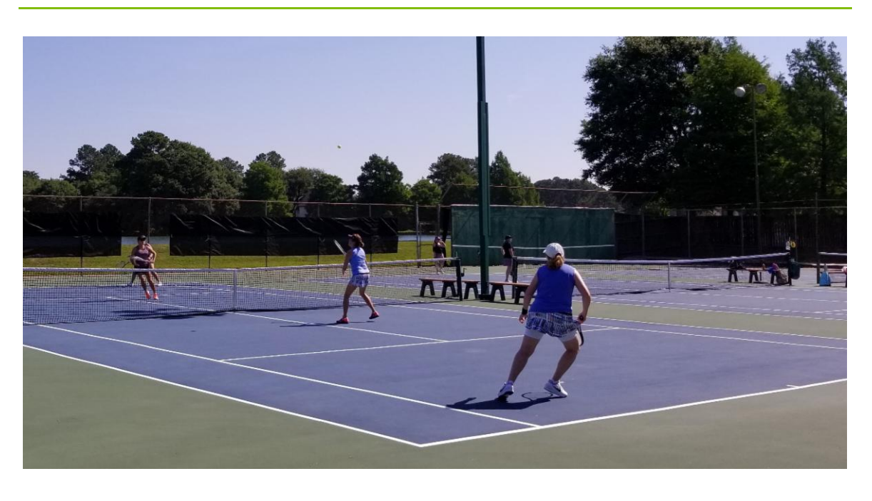
Fall Tennis at Lakewood Residents Club!

www.lakewoodrc.org lakewoodresidentsclub@gmail.com