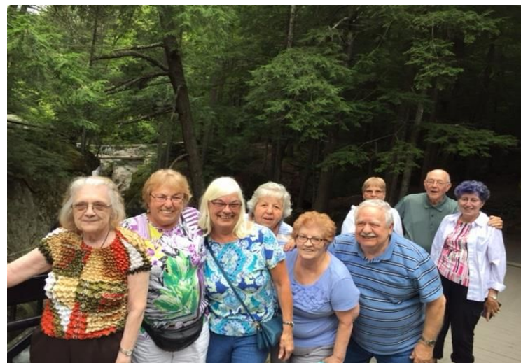
Some of our group having fun at Texas Falls in Hancock, VT.