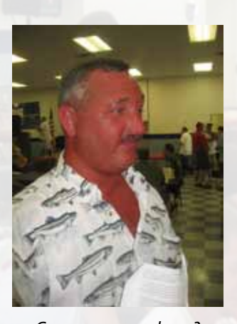
Can you say sunburn?