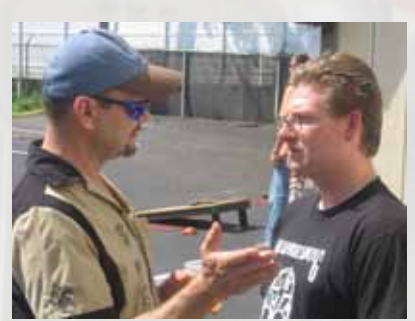
No, no, do it like this...