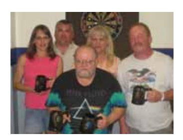
Mugs for Winners!