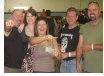
Frog people pointing