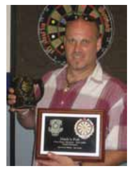
"CW" 2010 Pearl First Place