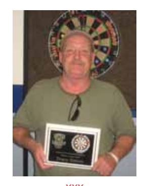
2010 Grenn Singles First