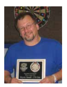
The trophy says it all!