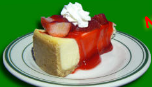
New York Cheesecake