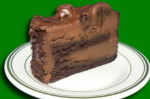
Choc'late Lovin' Spoon Cake