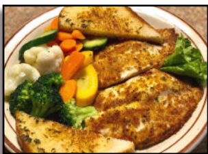
Grilled & Seasoned Fish