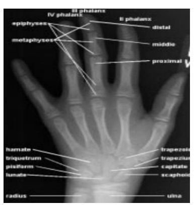
Fig.1: Bone Age Assessment

and understand the cause of the death and finally understanding the lifestyle, health conditions and climatic changes over the decades. The bone assessment allows the detection of the hormonal growth, geneticdisorder [1].Bone age had become a convenient measure of maturity in pediatrics, such as hormonal growing disorders since there are number of discriminants and unambiguous stages in the development of the hand and bones.