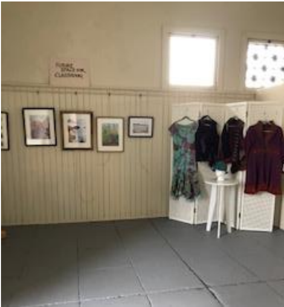
The new BRAG, classroom, and jurying room