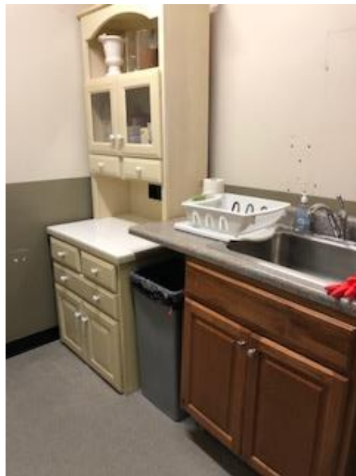
Old fixtures removed; new working sink and cabinet

See more East Wing Improvements on next page