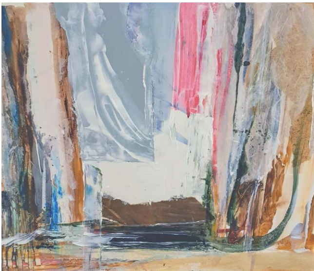
“Dockside in Winter” – first prize mixed media collage