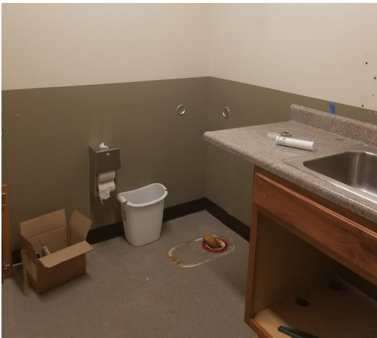
Old bathroom; new kitchen workroom under construction