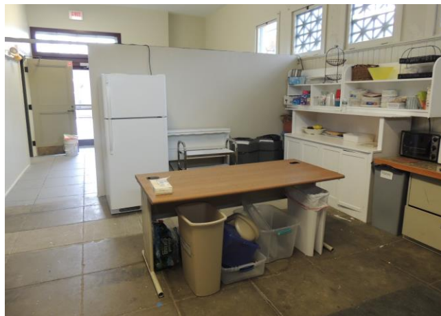
The new kitchen support area and preparation table