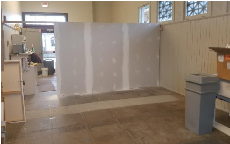
Dan Marantz built the divider wall to help separate uses of the East Wing

Many artist members and spouses have pitched in to turn the East Wing of the Westerly Train Station into an organized and useful multi-purpose room. The East Wing will serve as BRAG, classroom, jurying room, ACGOW office, kitchen support, artwork storage shelves, and general storage. Whew – thanks to everyone!