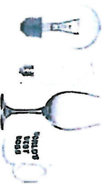
Light bulbs, drinking glasses, other glassware