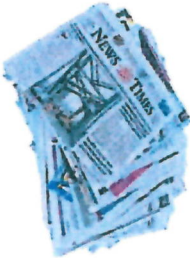
Newspaper & inserts