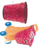
Flower pots, plastic toys