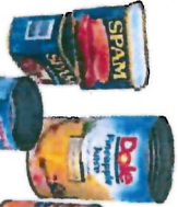
Clean metal food cans