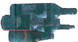
Glass jars & bottles