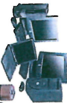
Batteries or electronics

DO NOT put these items in your recycling cart.