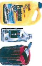
Hazardous or toxic product containers