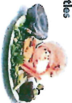
Food & wet waste, food contaminated paper plates and napkins