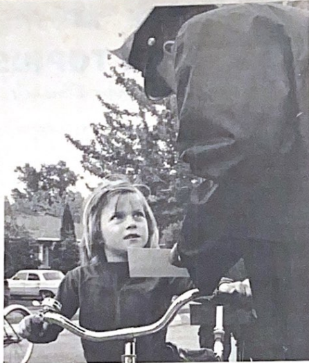
"No dear, this is not a ticket like Daddy usually gets. This is a list of rules for safe cycling."