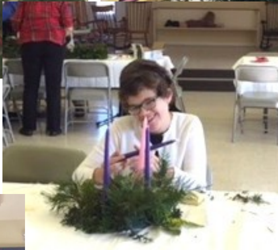
To Use at Home