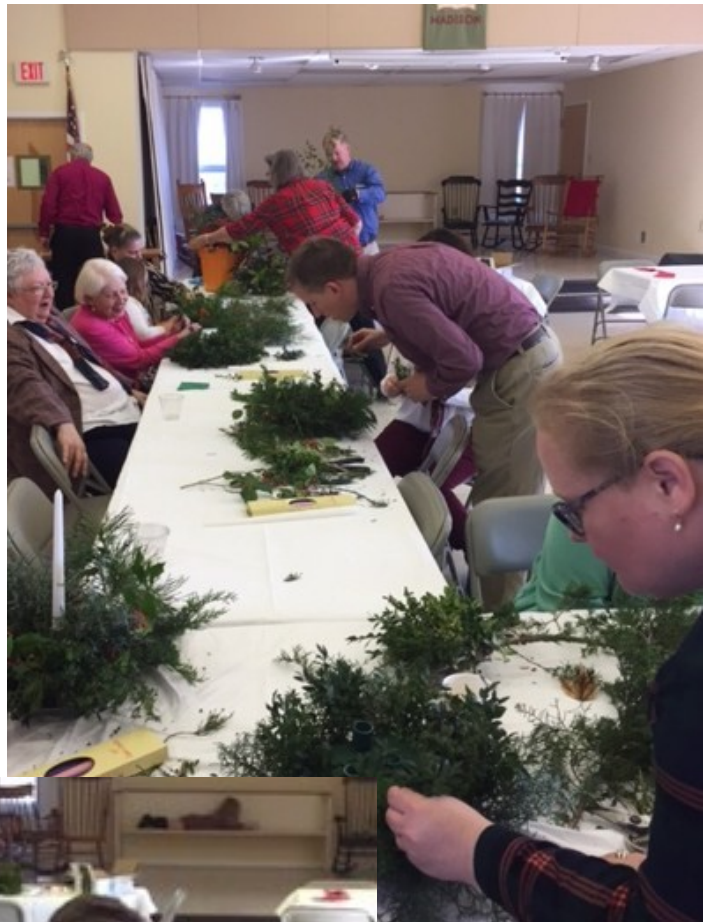
Making Advent Wreaths