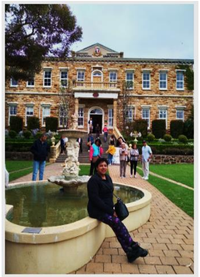
Free wine tasting at one of the grandest established wineries, Chateau Yaldara. Cheers!