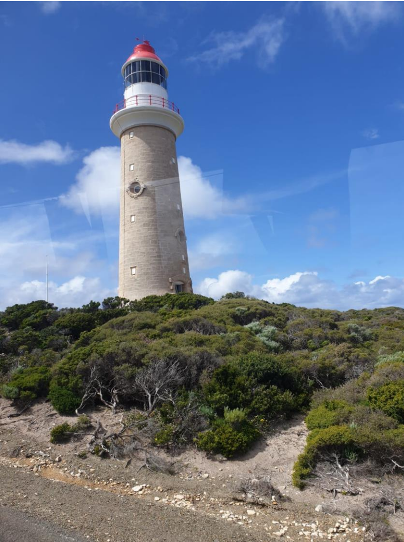
Cape du Couedic Lighthouse