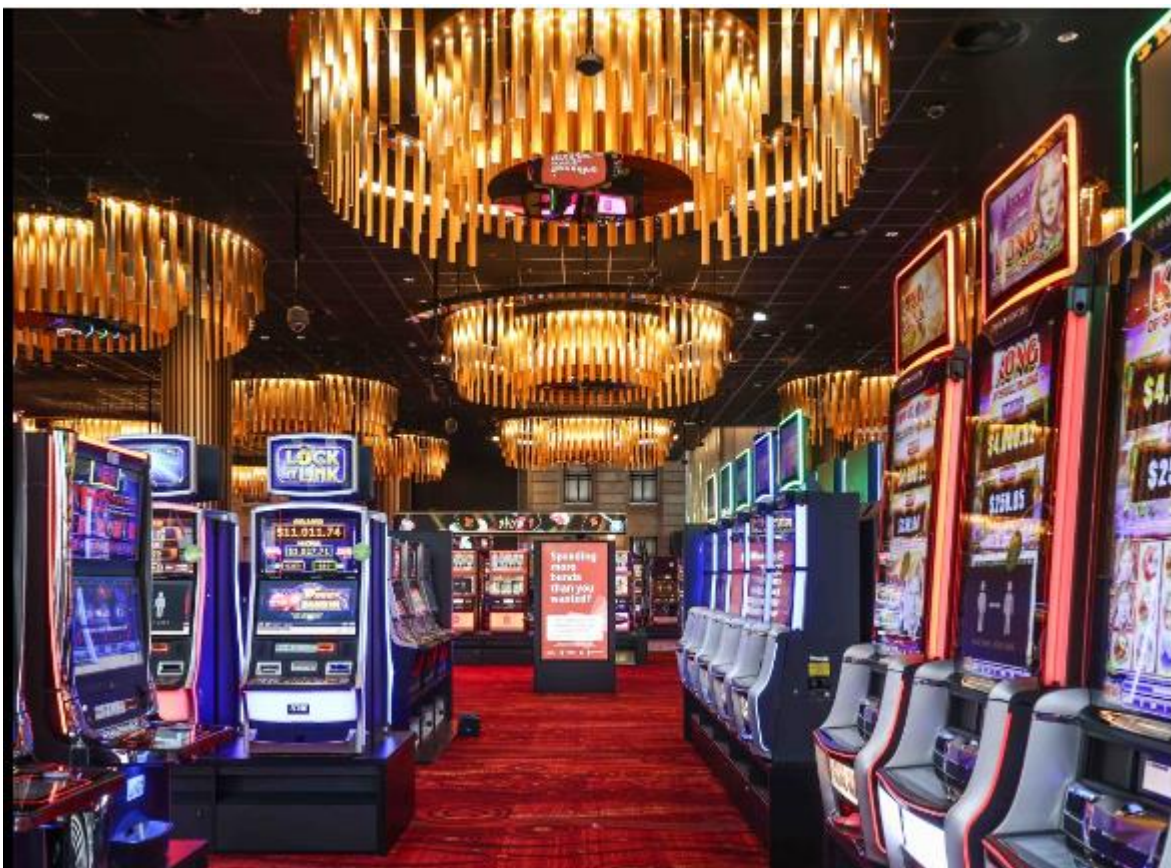
Night at the Sky-City Casino along-side the stately Adelaide Railway Station