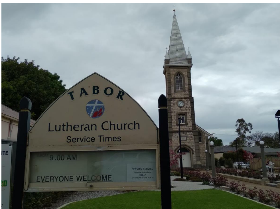
Lutheran Church on Murray Street – Good stop near Barossa Valley Visitor Centre for lunch options.