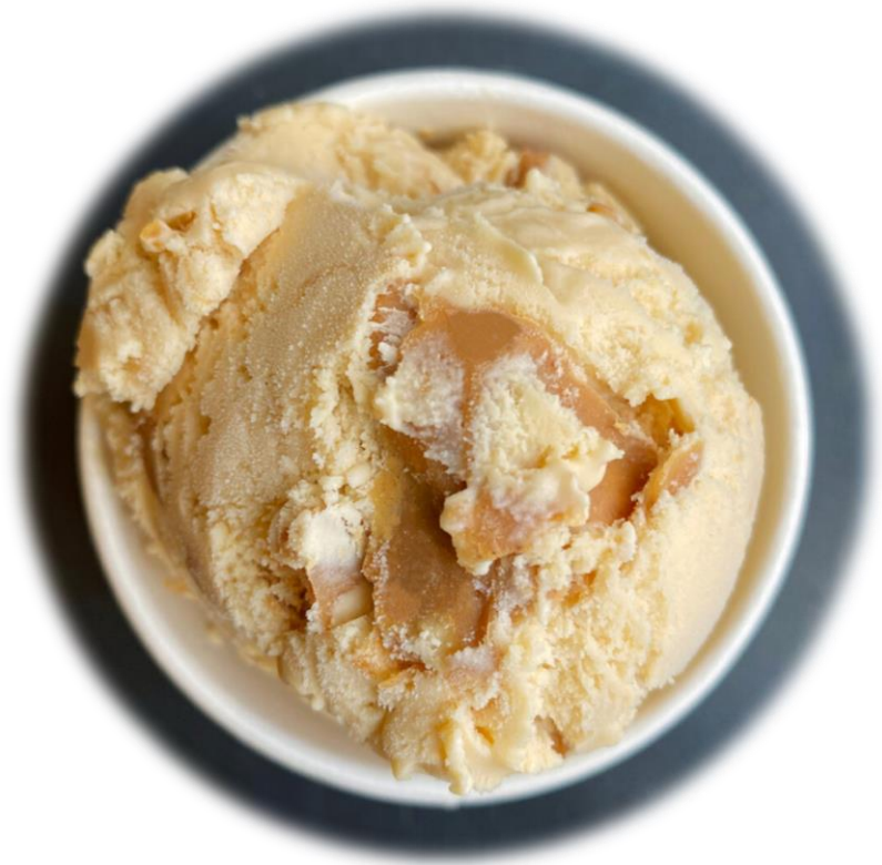
A close up shot of delicious honey ice-cream from Clifford's Honey Farm! The serve was not big-enough!