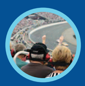
Motorsports Concerts Cruises Air Shows Rodeos Festivals Fairs