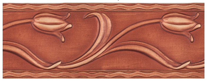
CC8023 TULIP H 31/2" (Shown in Cherry Gold)