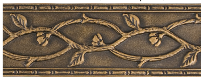
CC8030 BUD BRANCH H 31/2" (Shown in Antique Gold)