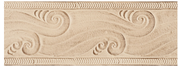
CC8071 SWIRLS H 41/8" (Shown in Antique White)