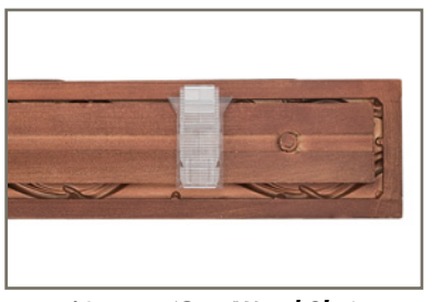
Narrow (One Wood Slat)