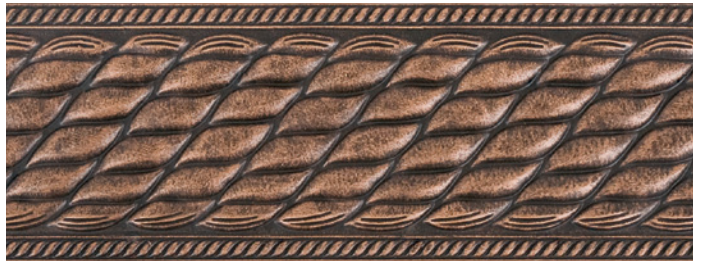
CC8073 Windblown H 4" (Shown in Antique Copper)