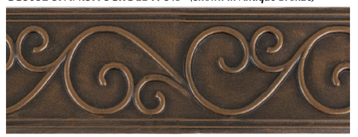
CC8032 SPANISH SCROLL H 31/2" (Shown in Antique Bronze)