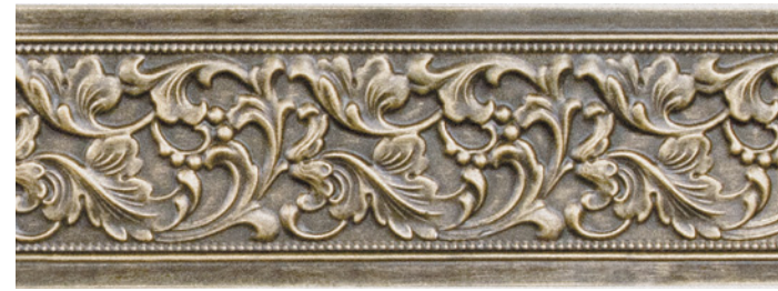
CC8034 SPRING LEAF H 3¾" (Shown in Gold Antique White)