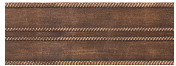
CC8057 CLASSIC H 31/2" (Shown in Burnt Gold)