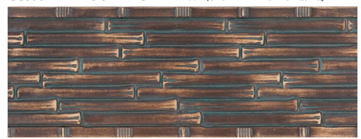
CC8061 BAMBOO DELIGHT H 41/8" (Shown in Bronze Patina)