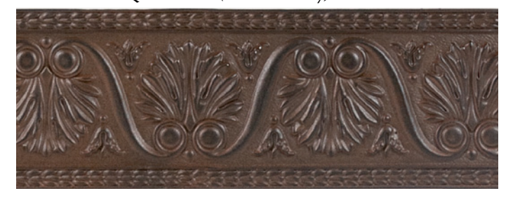
CC8026 BAROQUE H 3%8" (Shown in Rusty)