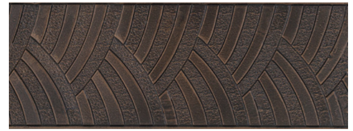
CC8063 Sunbursts H 41/8" (Shown in Antique Bronze)