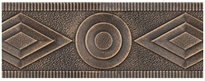
CC8055 INFINITE GEOMETRY H 35/8" (Shown in Antique Gold)