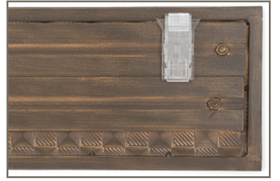
Tall (Two Wood Slats)