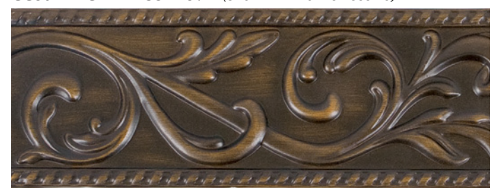
CC8021 ACANTHUS H 31/2" (Shown in Bronze Vecchio)