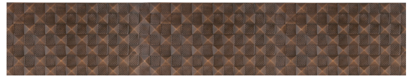
CC8077 LATTICE WEAVE H 61/8" (Shown in Bronze Vecchio)

CC8075 PYRAMIDS H 6" (Shown in Vecchio Patina)