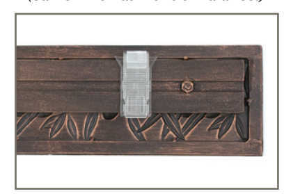
Medium (One Wood Slat)