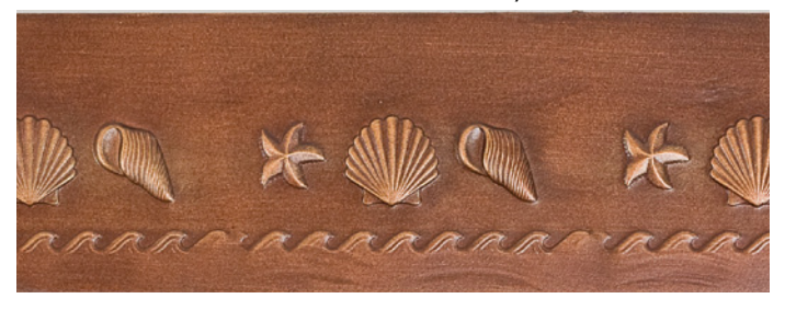
CC8036 SEA SHORE H 33/4" (Shown in Cherry Gold)