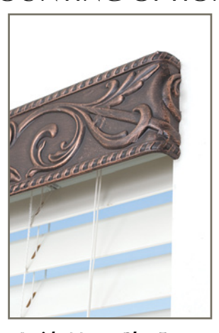
Inside Mount Plus Frame