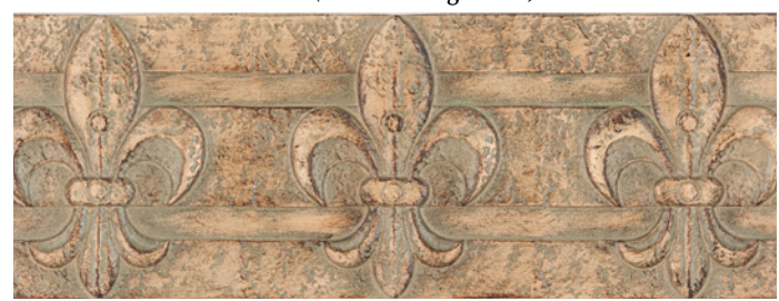
CC8069 EMBLEM H 41/4" (Shown in Sage Gold)