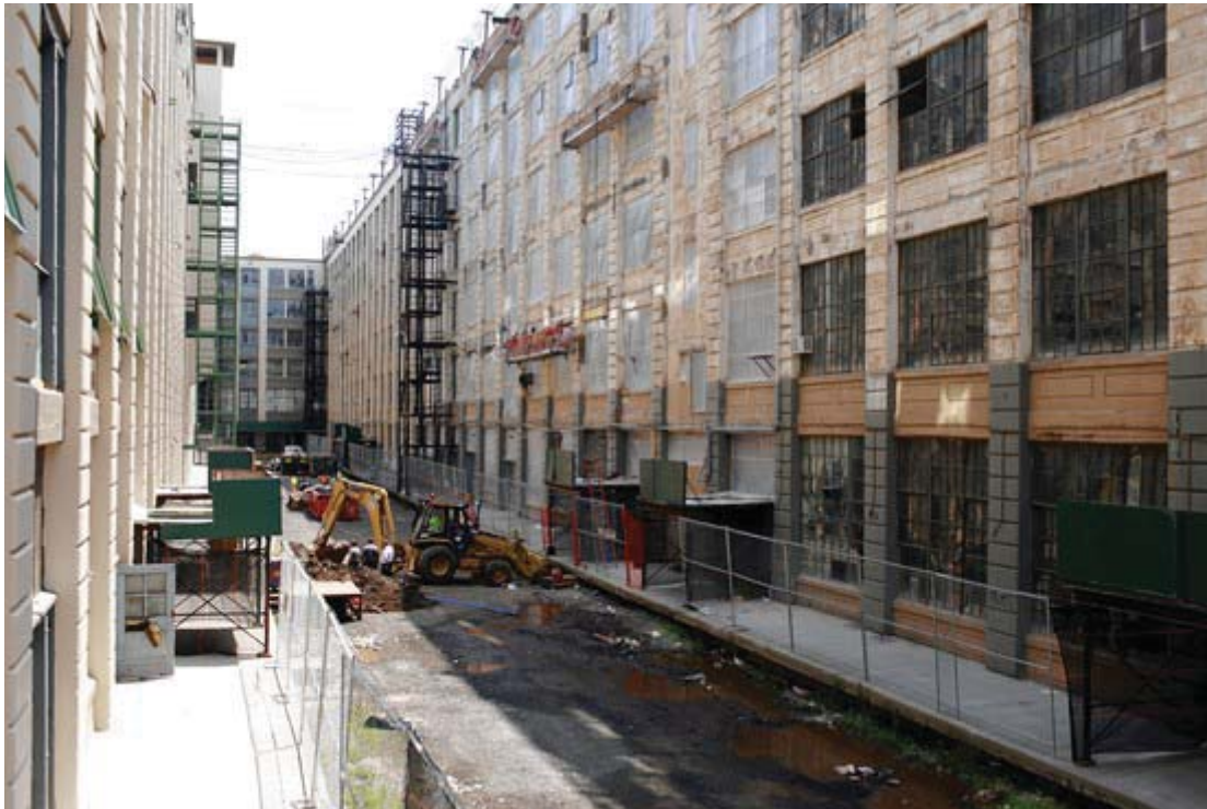
Industry City in Brooklyn's Sunset Park is undergoing renovation.

However, food manufacturing jobs have increased nearly 8% since 2008, according to a recent report from the city's Independent Budget Office. A number of types of manufacturing saw steep declines, such as apparel manufacturing, where jobs decreased more than 25%.