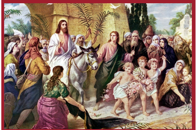
As the Lord entered the holy city, the children of the Hebrews proclaimed the resurrection of life. Waving their branches of palm, they cried: Hosanna in the Highest!