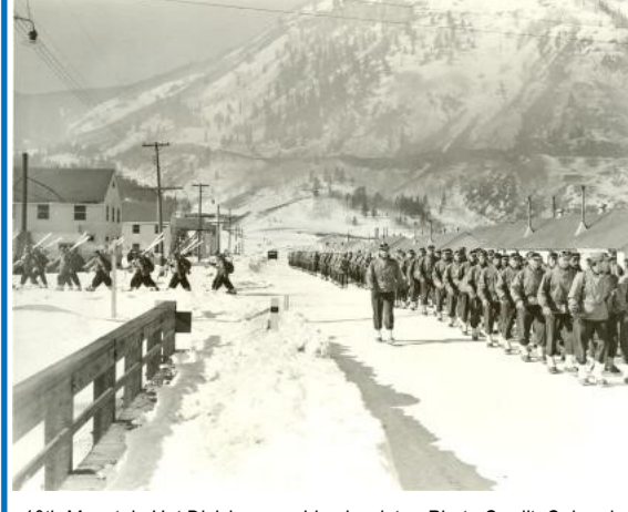
10th Mountain Hut Division marching in winter.

camping were some of the skills that the soldiers were taught. They spent about nine months in rigorous training at elevations of 9,000 feet or greater, often with packs on their backs weighing 70-90 pounds. The unit was originally intended to take part in an assault to liberate Norway, but plans were changed. Instead, they were sent to fight in France, Belgium, and Germany. After V-E Day, they finally made it to Norway where they were assigned to help with disarming the Nazi forces who were in Norway after the surrender.