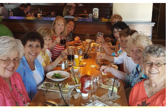
Chick Flicks group having fun dining at BJ's Restaurant after the movie "Going in Style."

May 18 luncheon at Stoneybrook Golf and Country Club Contínued. . . .