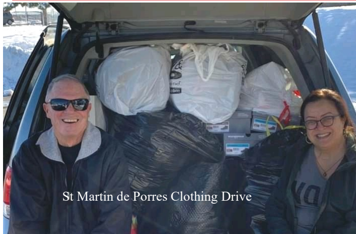
St Martin de Porres Clothing Drive