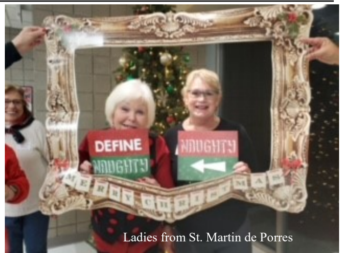
Ladies from St. Martin de Porres