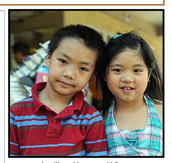
Auxiliary News and Views