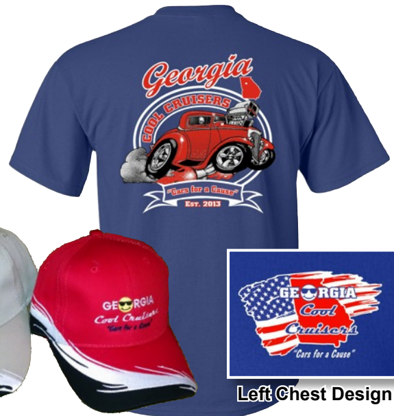
Left Chest Design