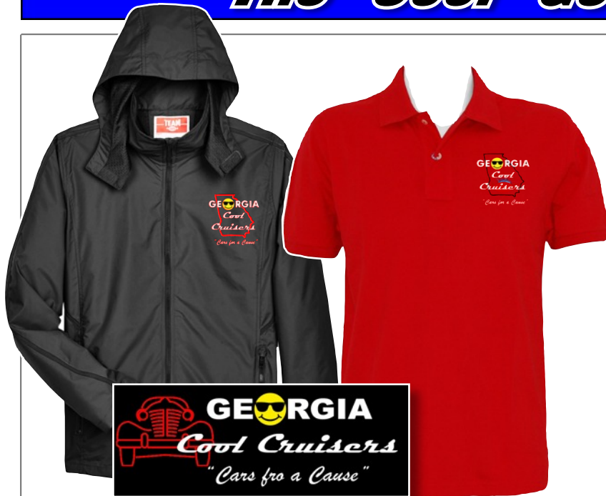
Jacket Back Design