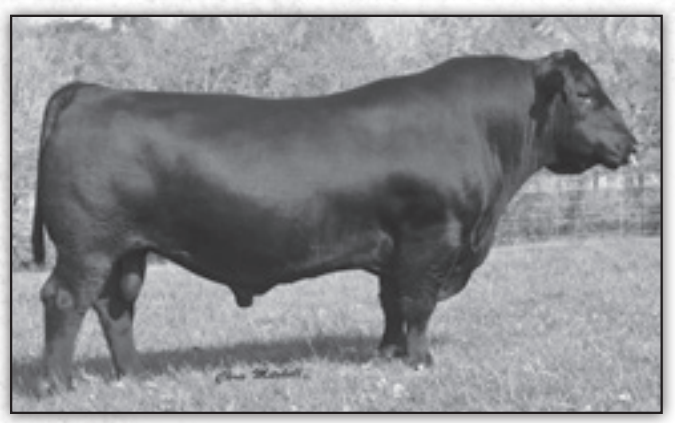
BOYD SIGNATURE 1014 - His influence sells.