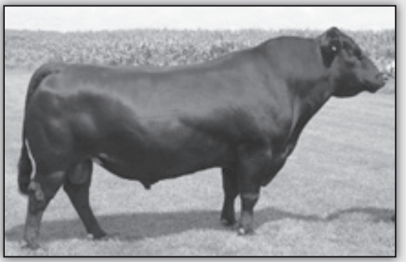
K C F BENNETT ABSOLUTE - Reference Sire E.