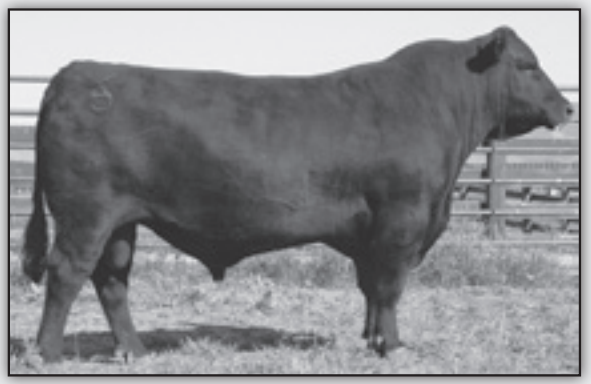
A A R TEN X 7008 S A - Reference Sire B.