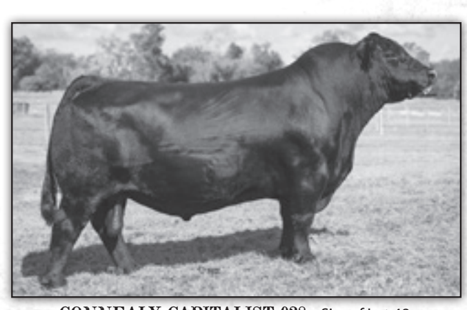
CONNEALY CAPITALIST 028 - Sire of Lot 48.