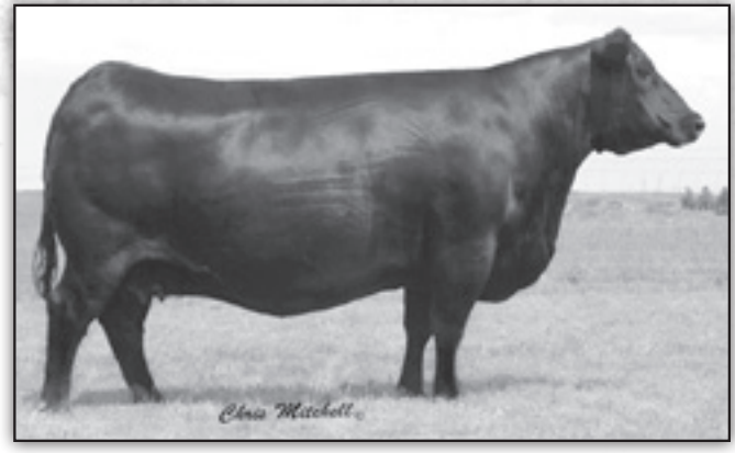
THREE TREES ENTENSE 567G - Her influence sells.