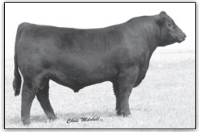
CONNEALY CONFIDENCE 0100 - Sire of Lot 66.

RV BAR CONFIDENCE R612 [DDF-OHF] Birth Date: 3-11-2016 Bull 18657656 Tattoo: R612 Connealy Tobin #Bon View New Design 208 $W Connealy Confidence 0100 Delia of Conanga 667 +73.16 #Connealy Thunder (RDF) 16761479 Becka Gala of Conanga 8281 $F Becka Lee of Conanga 37 +63.90 RV Exar R013 #EXAR 263C #RV Redirect 7423 RV Bar Blackbird 3073 +30.78 17774360 RV Mytty Blackbrid Lady97073 #Mytty In Focus (RDF) $B #Nelson Miss Blackbird 7073 +104.89 REA +15 .39 | -1.0 .44 | +60 .33 | +101 .32 | +24 +.42 +.91 · Individual Records: BR 96, WR 106. ww BW 768