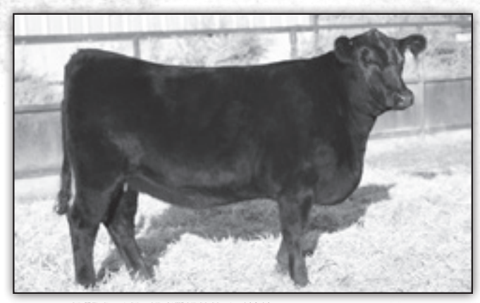
RV BAR ESTELLA 525 - She sells as Lot 69.