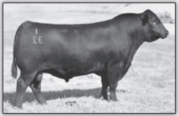
CONNEALY BLACK GRANITE - Reference Sire G.