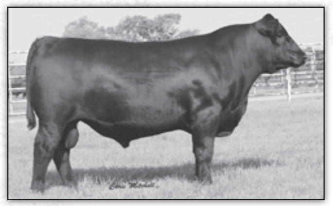
DEER VALLEY ALL IN - Reference Sire H.

#Mytty In Focus [RDF] AAR Ten X 7008 SA #15719841 #AAR Lady Kelton 5551