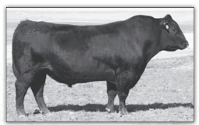
LLC NEW STANDARD - His influence sells.