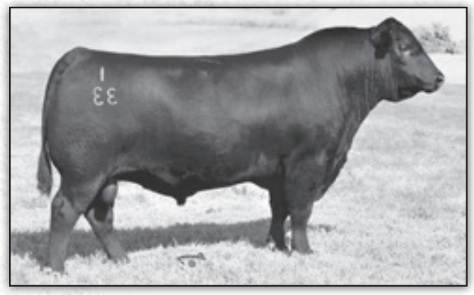
CONNEALY BLACK GRANITE - His influence sells.