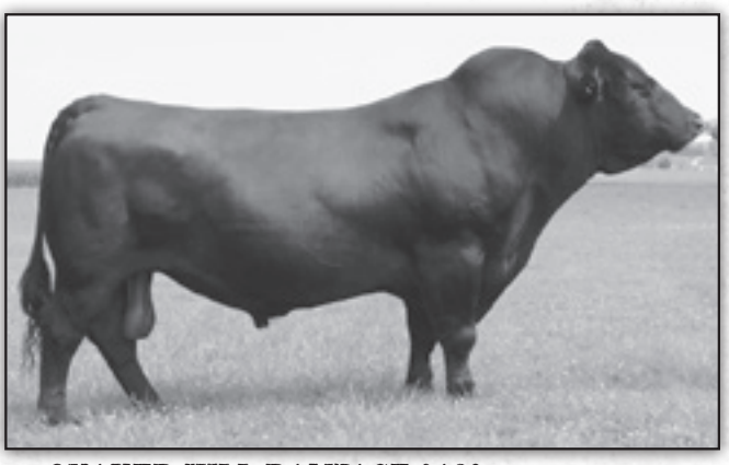
QUAKER HILL RAMPAGE 0A36 - His service sells.

• Bred to calve February 16-March 3, 2017 to QUAKER HILL RAMPAGE 0A36. Exposed to RV Bar Black Granite R501.