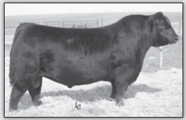
R B TOUR OF DUTY 177 - Reference Sire F.

CED BEPD WEPD YEPD MILK MARB REA +6 .88 +2.4 .96 +67 .95 +121 .89 +30 .42 +.45 +.94