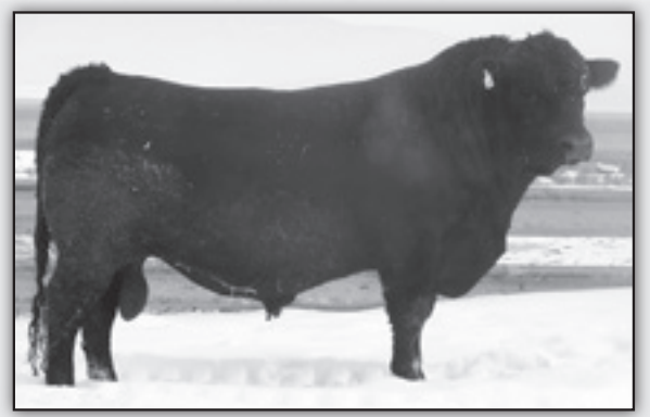
RV EXAR R013 - Reference Sire D.