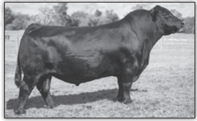
CONNEALY CAPITALIST 028 - His influence sells.