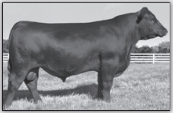
V A R DISCOVERY 2240 - Reference Sire C.