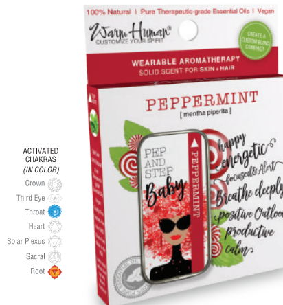
WHSTB-110-8 | PEPPERMINT mentha piperita 100% Pure Therapeutic-grade

Makes you feel confident, stable, peaceful, grounded, connected to yourself and others, capable of doing things and taking care of yourself, lucky, grateful, sensual