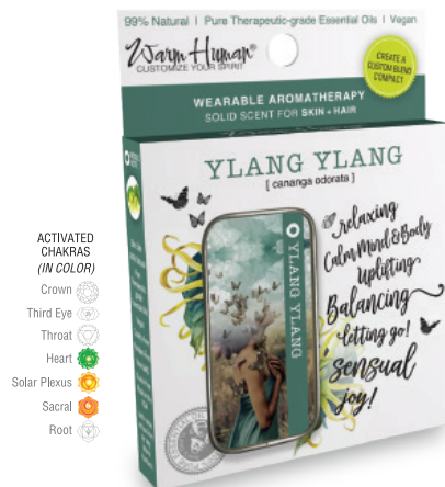
WHSTB-119-8 | YLANG YLANG cananga odorata 100% Pure Therapeutic-grade

Makes you feel happy, tranquil, relaxed, in harmony with yourself and life, warm, loving, sensual