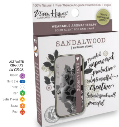
WHSTB-112-8 | SANDALWOOD santalum album 100% Pure Therapeutic-grade

Makes you feel happy, mindful, grounded, strong, connected to yourself and others, confident, calm, productive, have less stress and anxiety, able to meditate