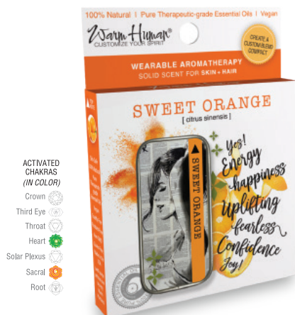
WHSTB-115-8 | SWEET ORANGE citrus sinensis 100% Pure Therapeutic-grade

Makes you feel relaxed, calm, joyful, happy, have energy, able to focus and learn, patient with yourself and others, kind, stress-free