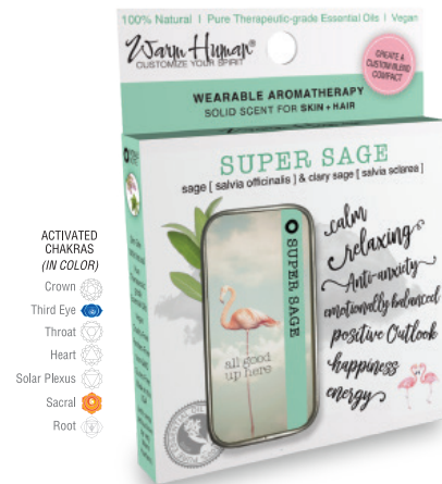
WHSTB-114-8 | SUPER SAGE CLARY SAGE salvia sclarea + SAGE salvia officinalis 100% Pure Therapeutic-grade

Makes you feel confident, blessed, fortunate, strong, intuitive, able to move toward in life, positive, able to learn from mistakes and turn them into positives