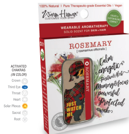
WHSTB-120-8 | ROSEMARY rosmarinus officinalis 100% Pure Therapeutic-grade

Makes you feel alert, focused, happy, energetic, good enough, less resentful, less prideful