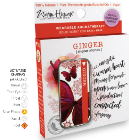
WHSTB-103-8 | GINGER zingiber officinale 100% Pure Therapeutic-grade

Makes you feel more open-hearted, forgiving, able to move forward, warm emotionally and physically, attractive, prosperous, lucky, courageous, safe because you are self-reliant