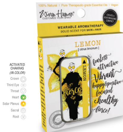
WHSTB-106-8 | LEMON citrus limonum 100% Pure Therapeutic-grade

Makes you feel calm, positive, helps you communicate better, and listen better, kind to yourself and others, have less anxiety and stress, helps you sleep better, self-care