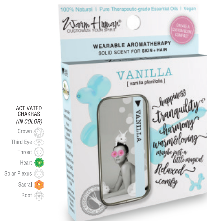
WHSTB-118-8 | VANILLA vanilla planifolia 100% Pure Therapeutic-grade

Makes you feel confident, feminine, warm, happy, loving, sensual, libido enhancer, compassionate toward yourself and others, creative