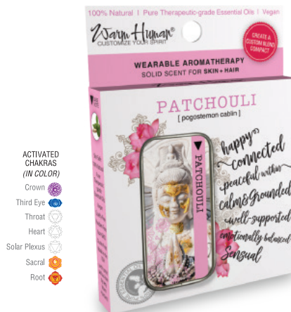
WHSTB-109-8 | PATCHOULI pogostemon cablin 100% Pure Therapeutic-grade

Makes you feel happy, inspired and inspiring, grounded, confident, strong, worry-free, calm, connected to others, fearless, motivated