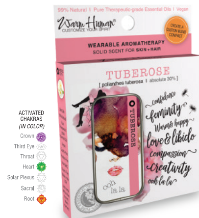
WHSTB-117-8 | TUBEROSE polianthes tuberosa absolute 30% 99% Natural

Makes you feel creative, vibrant, sensual, positive, okay being/thinking unconventionally, emotionally balanced, peaceful, relaxed