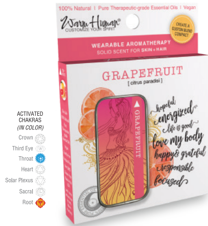
WHSTB-104-8 | GRAPEFRUIT citrus paradisi 100% Pure Therapeutic-grade

Makes you feel more open-hearted, forgiving, able to move forward, warm emotionally and physically, attractive, prosperous, lucky, courageous, safe because you are self-reliant