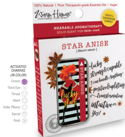
WHSTB-113-8 | STAR ANISE illicium verum 100% Pure Therapeutic-grade

Makes you feel happy, mindful, grounded, strong, connected to yourself and others, confident, calm, productive, have less stress and anxiety, able to meditate