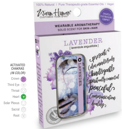
WHSTB-105-8 | LAVENDER lavendula angustifolia 100% Pure Therapeutic-grade

Makes you feel happy, positive, love your body, focused, responsible for your own life, hopeful, peaceful, less stressed or anxious, reminds you that life is good