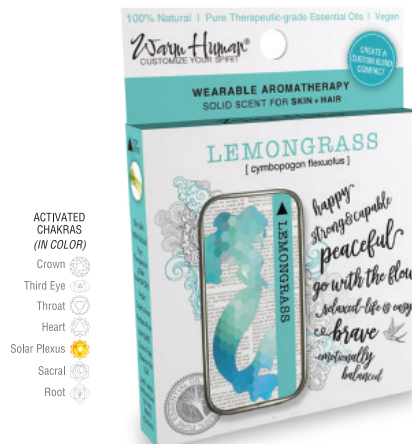
WHSTB-107-8 | LEMONGRASS cymbopogon flexuosus 100% Pure Therapeutic-grade

Makes you feel happy, vibrant, fearless, attractive, productive, focused, alert, energetic, healthy, less stressed