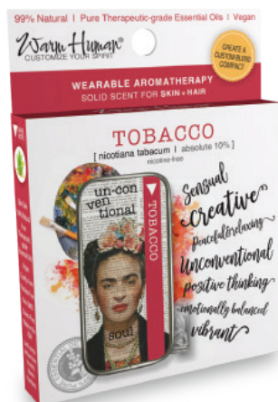
WHSTB-116-8 | TOBACCO nicotiana tabacum absolute 10% (nicotine tree) 99% Natural

Makes you feel happy, vibrant, fearless, attractive, productive, focused, alert, energetic, healthy, less stressed