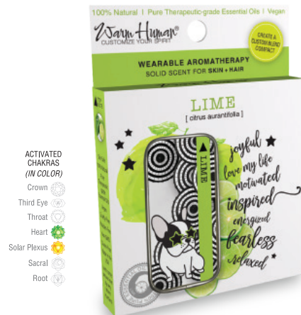
WHSTB-108-8 | LIME citrus aurantifolia 100% Pure Therapeutic-grade

Makes you feel happy, calm, like you can go with the flow, have an easier time with transitions or changes, alleviate grief and sorrow, feel more emotionally balanced, strong and capable