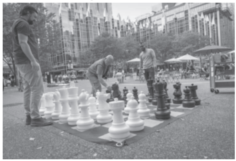
Having fun at the Downtown Night Markets.