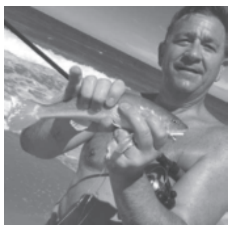
A beautiful mullet from Sandbridge Beach Virgina

My family and I have also had a chance to get away a little bit during the month of June. The beach in Virginia was very choppy but getting smashed to pieces to surf cast was worth it. One of our pictures is of a very nice mullet from day one of our beach vacation.