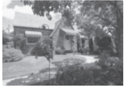
5 McMonagle Ave. $229,900 Charm inside and out!