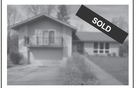
1150 Greenridge Lane $344,500 Custom Built Multi Level