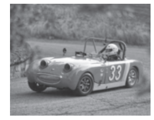
1959 Austin Healey Sprite at the 2018 PVGP

Summer will pass before we realize so try to "stop and smell the roses" as they say or create a summer bucket list checklist and have no regrets come September!