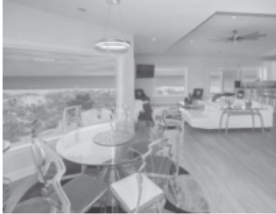
Wake up to this every morning!

See why your neighbors in PA visit Sandbridge Beach...the Outer Banks of Virginia!