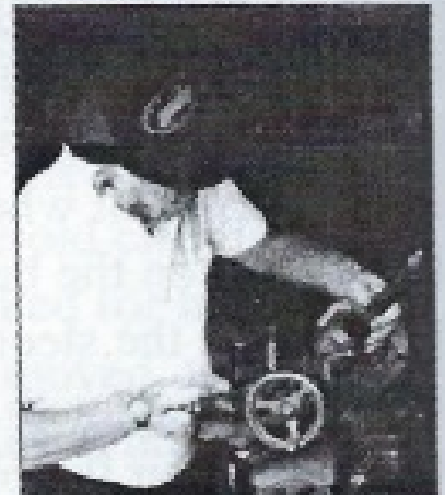
Red E. Power