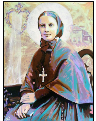
Feast Day: November 13

Refused admission to the religious order which had educated her to be a teacher, she began charitable work at the House of Providence Orphanage in Cadogno, Italy. In September 1877, she made her vows there and took the religious habit.