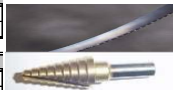
BROCA ESCALONADA AUTOCENTRABLE DE