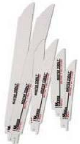
SIERRA SABLE MASTER COBALTO