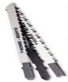
SIERRAS PARA CALDORA EN