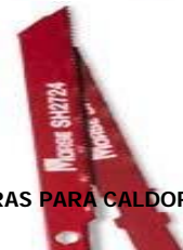
SIERRAS PARA CALADORA EN