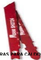
SIERRAS PARA CALADORA FN