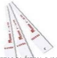
SEGUETAS BI-METAL P/SIERRA