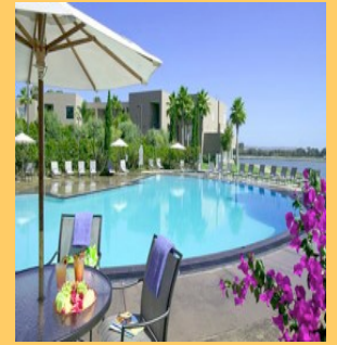
The Dana Inn

1710 W Mission Bay Dr, San Diego, CA 92109 Located 2 minutes away from the Conference Center Visit them at www.thedana.com for accommodations Phone: 619.222.6440