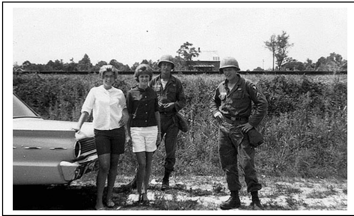
Two detainees being held by 101 st Paratroopers at a roadblock. They no doubt felt they had intelligence on the enemy (82 nd and 5 th Mech).