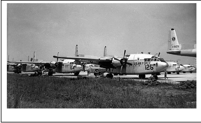
C-119 Flying Boxcar cargo aircraft, which were used by the 82 nd and the 101 st to jump into South Carolina for Swift Strike III.