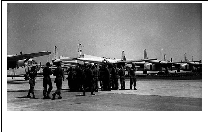
Paratroopers preparing to emplane for South Carolina. Planes flew from Pope AFB, Ft. Campbell, KY and Kinston, N.C.