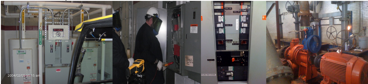
Above&below: Hidden air