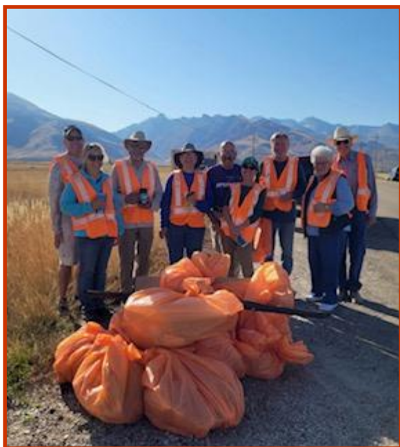
Thank you all that helped in the Highway Clean-up once again.