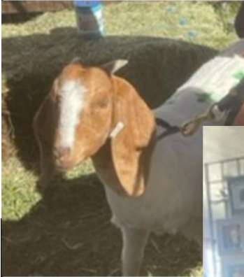
Several of the booths & of course we can't leave out our 4-H animals.