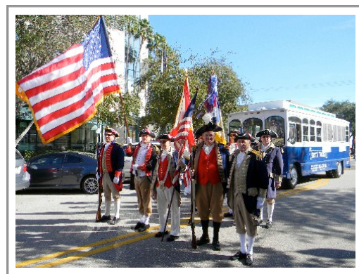
Saramana Color Guard steps off in the Sarasota Veterans Day Parade, November 11, 2011 (behind is the chapter trolley).