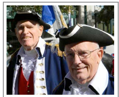
Do you know these Compatriots? Handsome, aren't they?