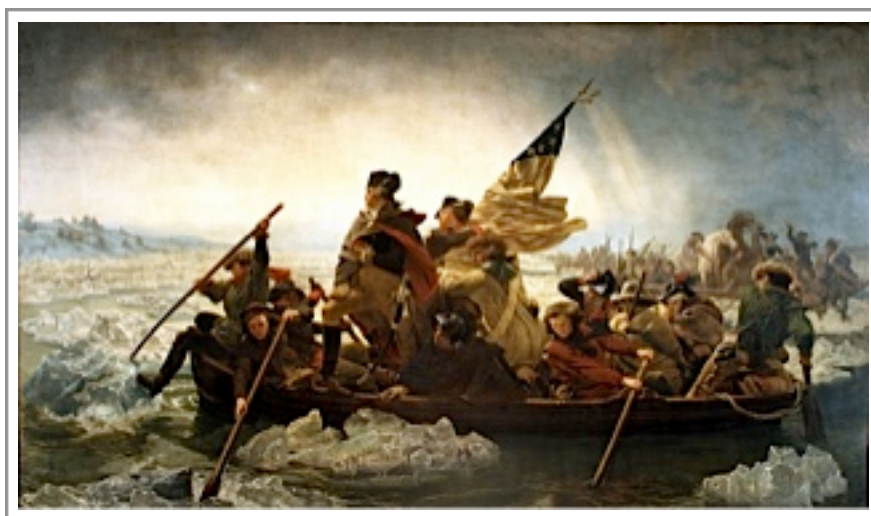
Washington Crosses the Delaware, by Emanuel Leutze

The date for the first Saramana Chapter luncheon meeting in 2012 has been changed to Friday, January 20th . More information will be available in the January Quill & Bugle , which will be sent to you before the end of December.