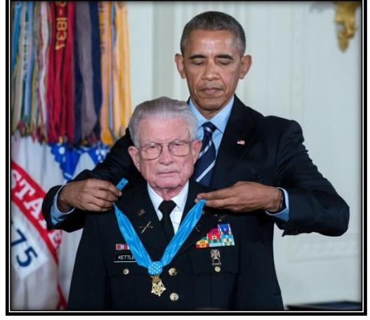
President Obama honoring Charles Kettles