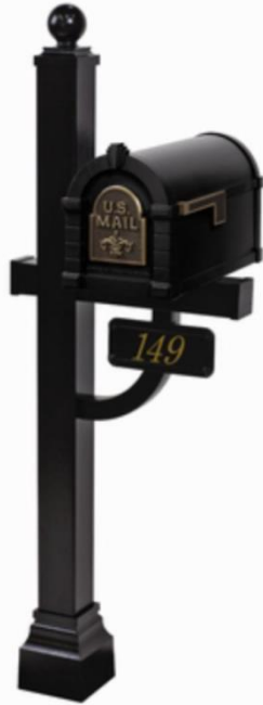
Single Post (KDX-BLK) – Black only