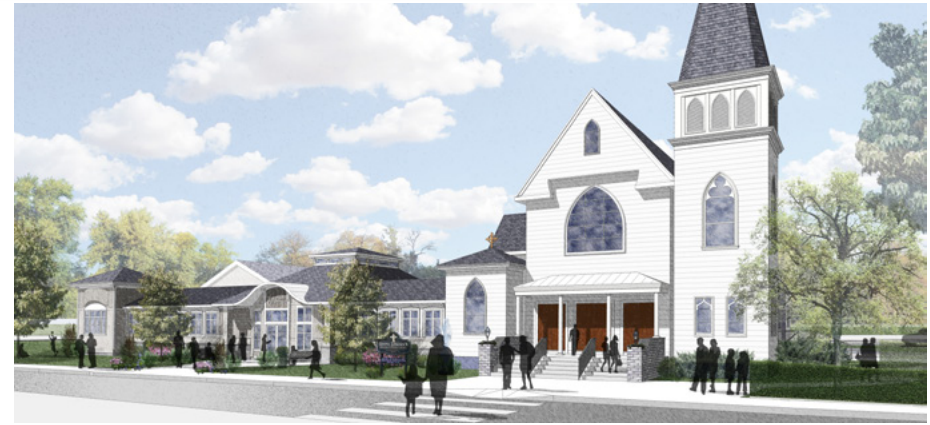
East Main Street View