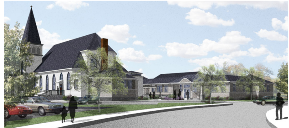
Church Street View