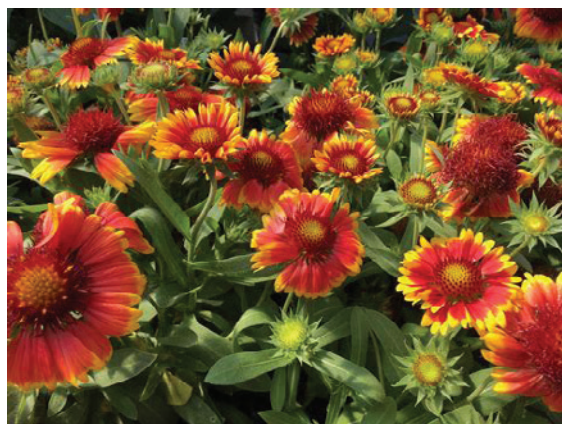
Indian Blanket (Gaillardia)