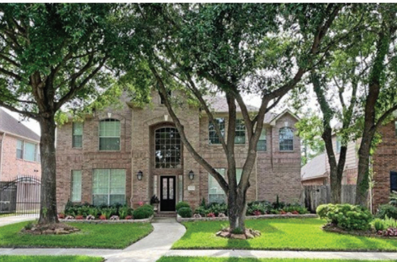
7803 Adagio Avenue Section 3