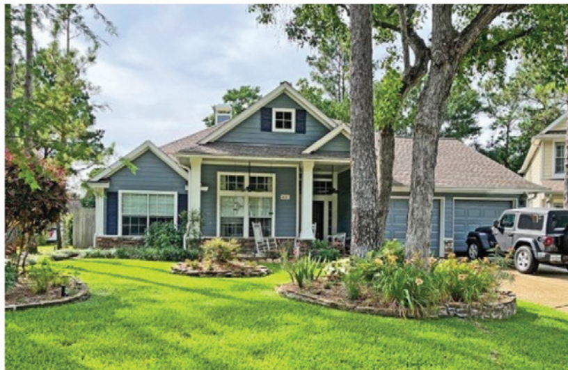
8103 Rondo Court Section 4