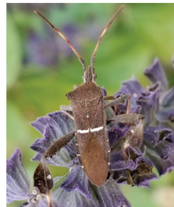
Adult leaffooted bug.

Leaffooted bugs feed on a variety of fruits, nuts and seeds, such as tomatoes, peppers, pecans or sunflower seeds. They have piercing-sucking mouthparts with which they puncture fruit to suck out juices. The opening left behind after the mouthpart is withdrawn can allow access to secondary invaders like bacteria or fungus.