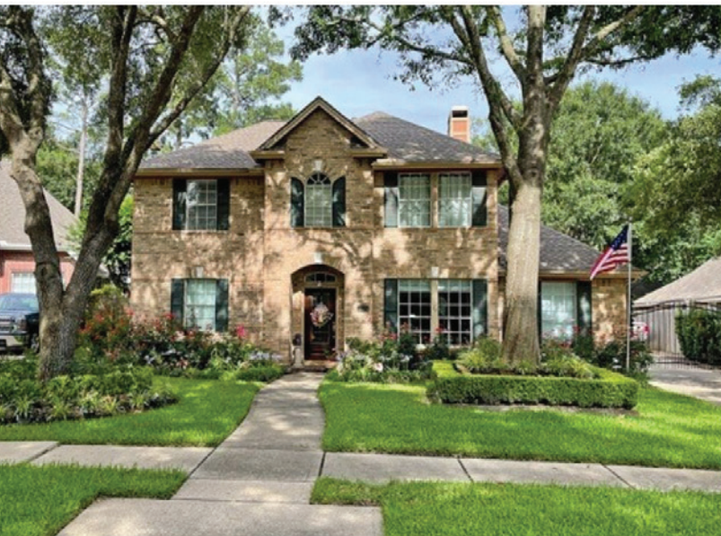
8106 Letica Drive Section 1