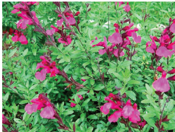
Autumn sage (Salvia)