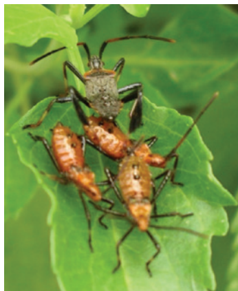
Immature leaffooted bugs.

Leaffooted bug adults may be mistaken for stink bugs while the immatures may get confused with assassin bug nymphs. Leaffooted bugs are larger than stink bugs and have an elongated body. Often, leaffooted bugs have an expanded region on their hind leg that looks similar to a leaf, hence the name leaffooted bug. Adults are fairly large and grayish-brown. Immatures, or nymphs, look similar to adults, but are often reddish-orange in color and do not have fully developed wings.