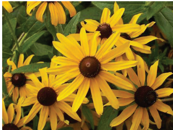
Black-Eyed Susan (Rudbeckia)