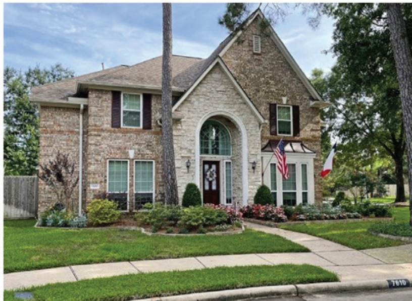
7610 Rolling Rock Street Section 2