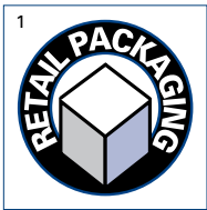
1. Retail packaging

These knurled grab bars are constructed of heavy-gauge steel for added stability with a knurled, chrome-plated finish that is rust-resistant. They mount in a variety of angles to a wall's structural supports, with rubber gaskets to protect the wall surface.