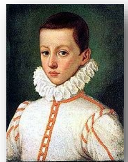
Feast Day: June 21

St. Aloysius was born in Italy in 1568. He was destined for the military by his father who was in service to Philip II, but by the age of 9 Aloysius had decided on a religious life. It was at that time that he went to Florence to be educated. By age 11 he was teaching catechism to poor children, fasting three days a week, and practicing great austerities. When he was 13, he traveled with his parents to Spain and acted as a page in the court of Philip II. The more Aloysius saw of court life, the more disillusioned he became.