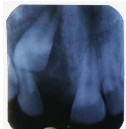
Figure 5: Intra oral periapical radiograph taken after surgery to confirm complete removal of the Odontome