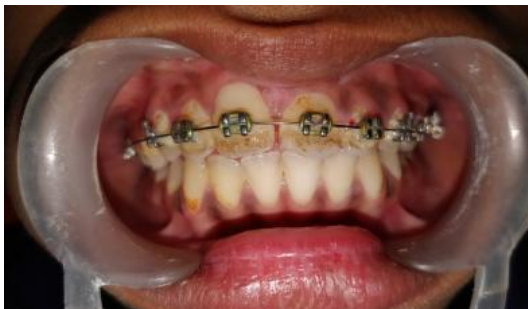
Figure 9: Intraoral view showing final alignment of 11 with 0.016 inch NiTi arch wire