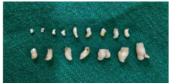
Figure 4: Excised compound odontoma showing multiple teeth like structures