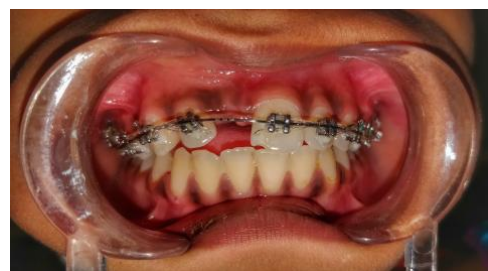
Figure 6: MBT bracket bonded on the maxillary teeth along with 0.012 inch NiTi arch wire and sectional E-chain