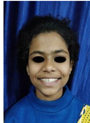
Figure 12: Post-treatment extraoral photograph