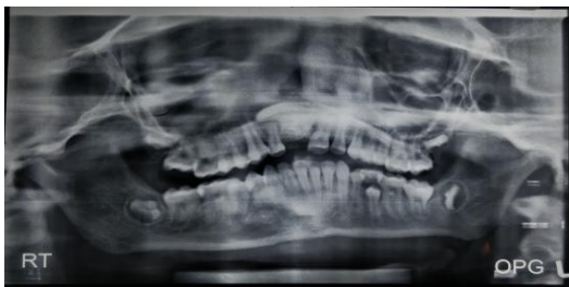
Figure 3: Pre-treatment panoramic radiograph