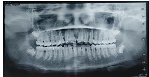
Figure 11: Post-treatment panoramic radiograph