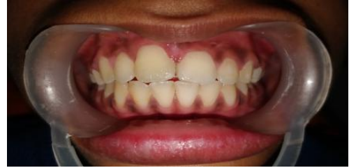
Figure 10: Post-treatment intraoral photograph showing well aligned 11 a minimum gingival height discrepancy