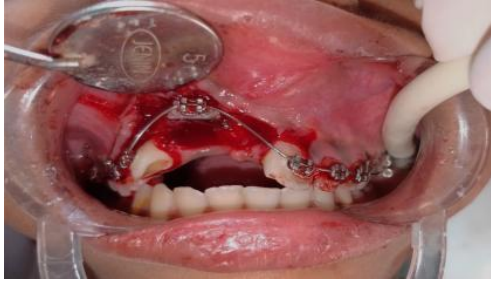
Figure 7: MBT bracket bonded on the impacted incisor along with 0.014 inch NiTi arch wire