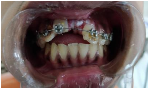
Figure 8: Intraoral photograph showing eruption of the maxillary right central incisor