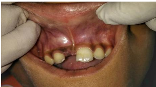
Figure 1: Pre-treatment intraoral photograph showing absence of 11