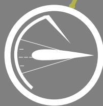
Angle of Attack