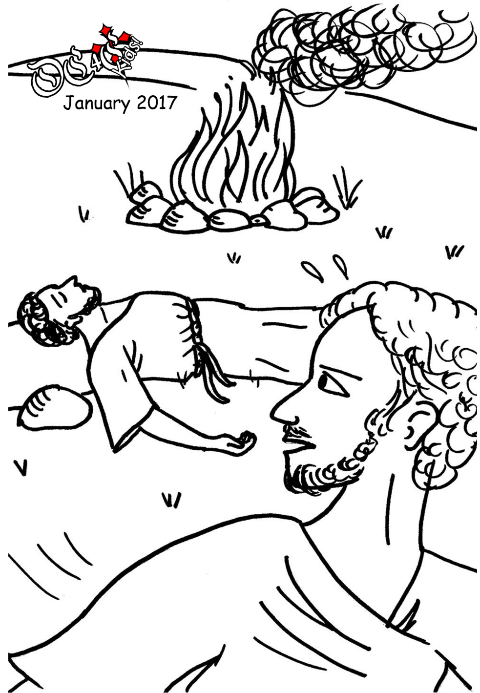
Cain & Abel