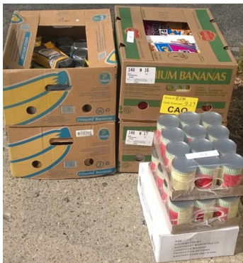
158 LBS. of Food from the HV Food Bank Thanks to Shir Chadash Donations