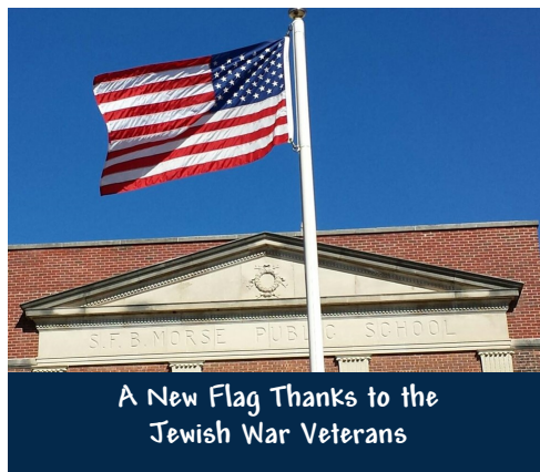
A New Flag Thanks to the Jewish War Veterans