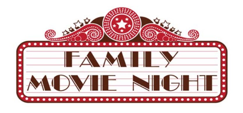
CHURCH FAMILY MOVIE NIGHT — Sunday, May 6th

Everyone is invited to join us in the Family Life Center for a family friendly movie and snacks on Sunday, May 6<sup>th</sup> from 5:00 to 7:00. Movie choice to be announced!