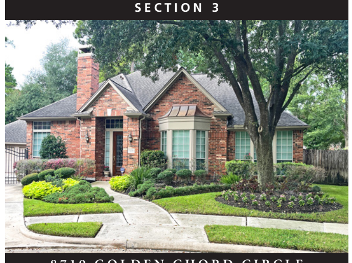
8719 GOLDEN CHORD CIRCLE