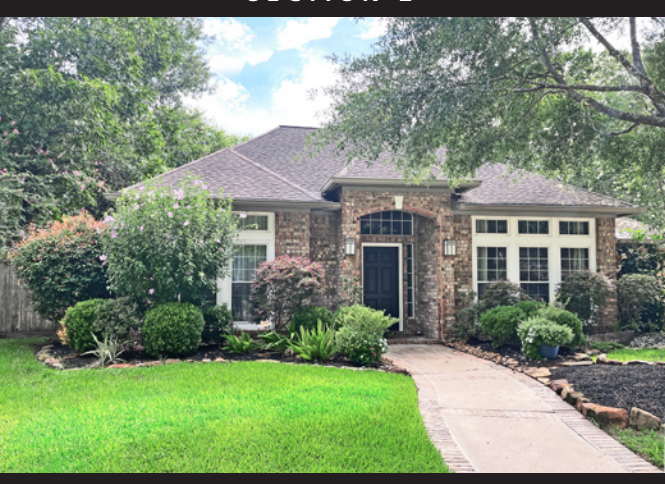
9126 RHAPSODY LANE