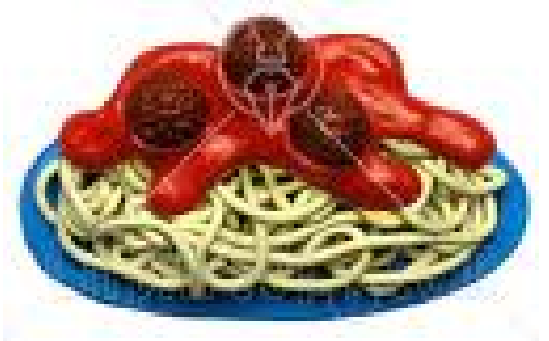
Spaghetti Dinner Provided with all the fixens'