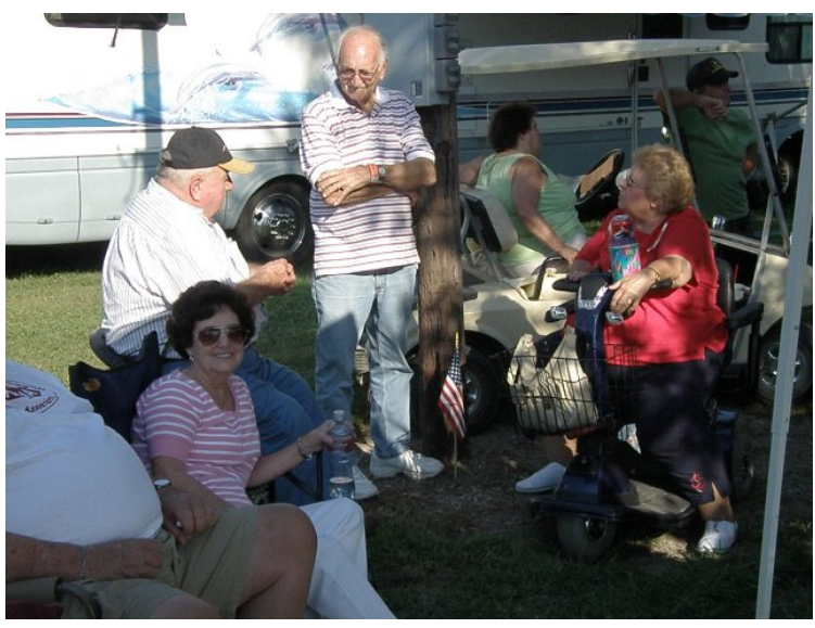
NKBMA members just hanging out have fun at the festival!