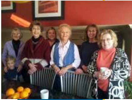
Enjoying coffee in February!